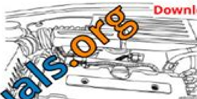
38: Identifying Breather Tube To Camshaft Cover (1 of 2)