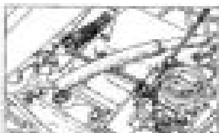
Fig. 1.7L Engine and air filter housing.