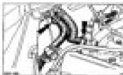
Fig. 1.7L Engine and air filter housing.