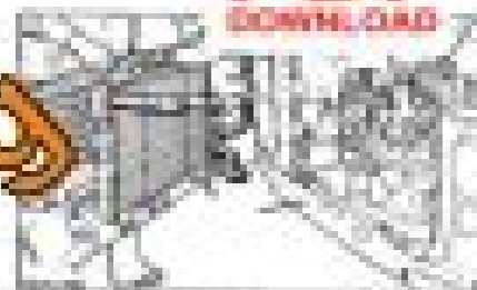
Fig. 1.7L Engine and air filter housing.