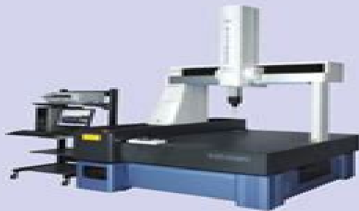
Standard CNC CMM MICROCORD CRYSTA-Apex S Series Refer to page N-3 for details.