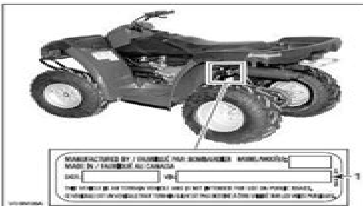
1. V.I.N. (Vehicle Identification Number)