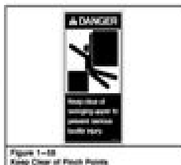
Figure 1-58 Keep Clear of Peak Points

The swing brake pedal is used to stop rotation of the upper over the carrier. To apply the swing brake, push down on the swing brake foot pedal. To release the swing brake, release the swing brake foot pedal.