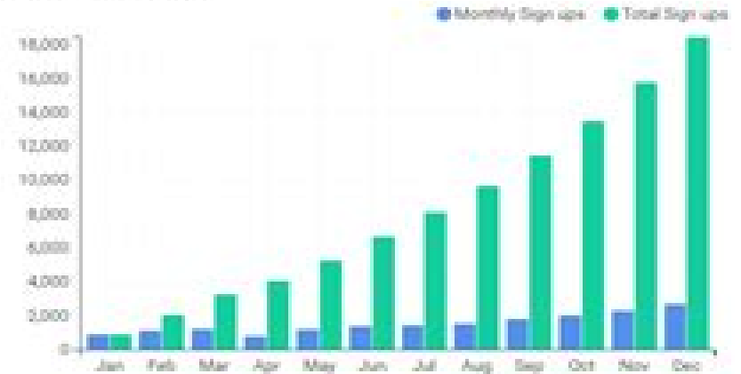
Monthly Sign Ups