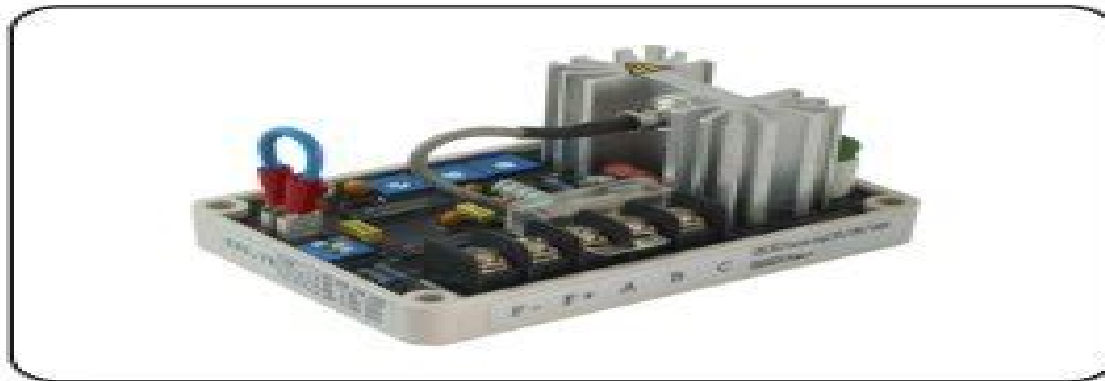
Self Excited Automatic Voltage Regulator 5 Amp AVR For General Generators