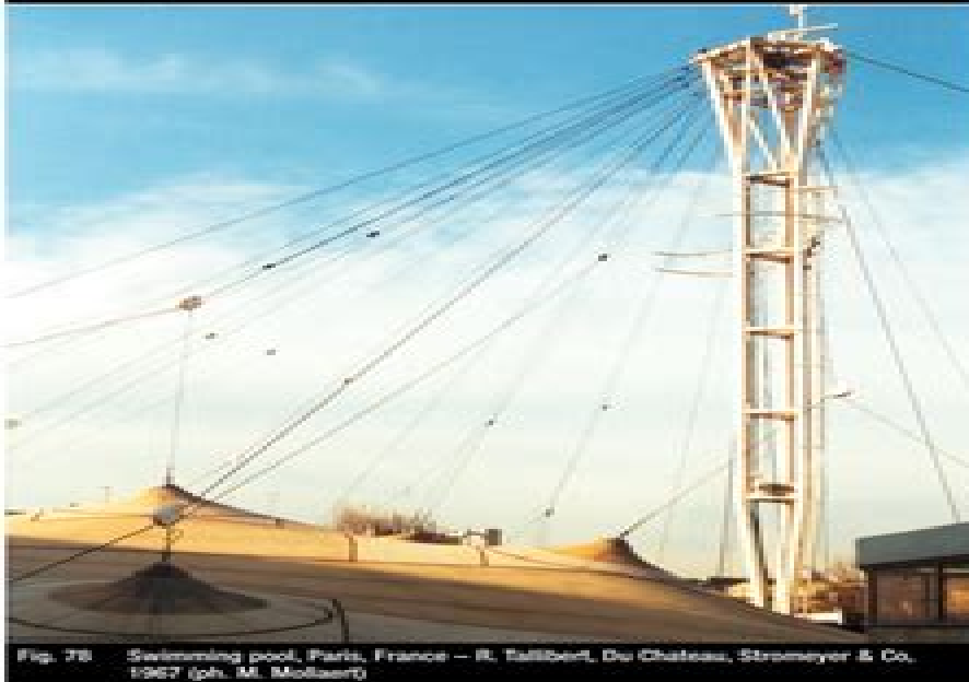
Fig. 78 Swimming pool, Paris, France – R. Tallibert, Du Chateau, Stromeyer & Co., 1967

A single skin cover for a swimming pool requires a high energy level input during winter since a relatively high internal temperature level needs to be maintained. The heating costs unfortunately are excessive.