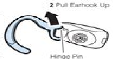
2 Pull Earhook Up