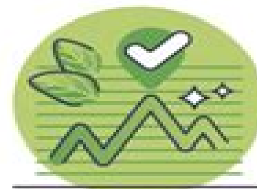
PLAN ACCORDING TO TRESHOLDS