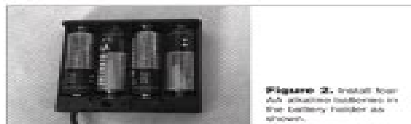
Figure 2. Install four AA alkaline batteries in the battery holder as shown.