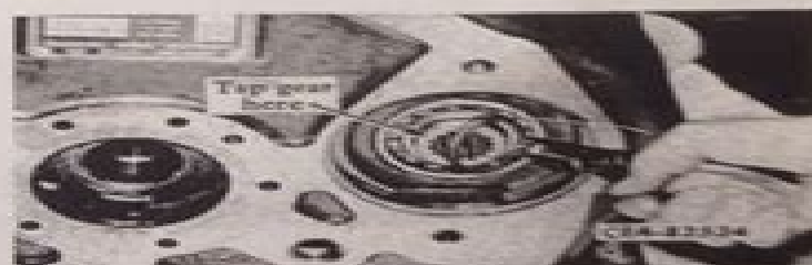
FIG. 27 — Removing the Equipment Pump Accessory Gear Snap Ring