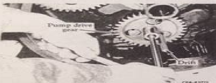
FIG. 24 — Removing the Input Pump Drive Gear Nut