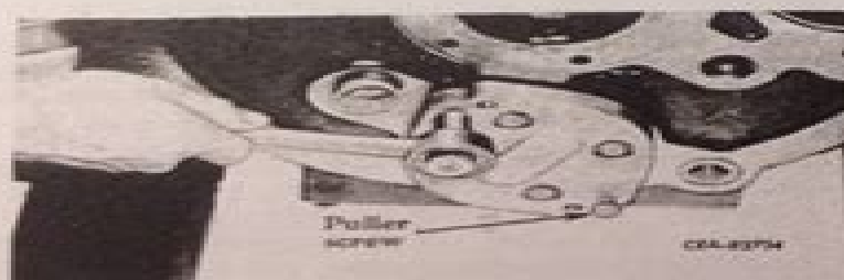
FIG. 25 — Removing the Input Pump