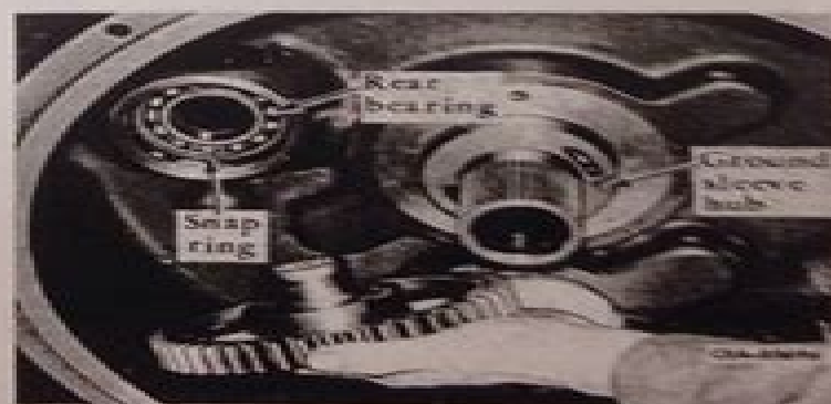
FIG. 28 — Removing the Equipment Pump Accessory Gear