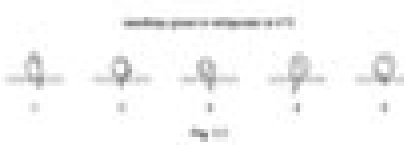
Diagram showing the last three stages of germination of a seedling at 20°C. The seedlings are significantly taller and have developed leaves.

Fig. 1.1 shows the first three stages of germination of a seedling.