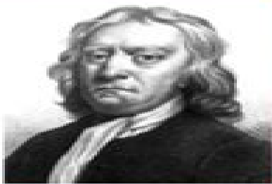
Sir Isaac Newton