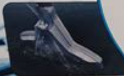
Wash & Dry - Carpets & Upholstery