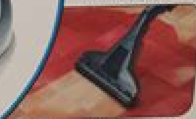
Wash & Dry - Hard Floors