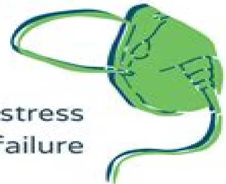
Resp. distress vs. failure