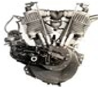
1911-1929 F-Head 50 ci 11 hp