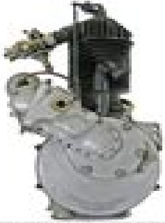
1903 Single Cylinder F-Head 35 ci 3.9 hp