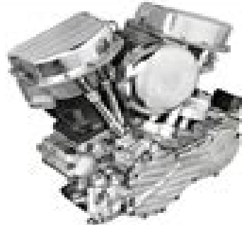
1948-1965 Panhead 990 cc & 1,200 cc 50 hp & 55 hp