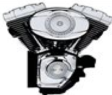
2007 Twin Cam 96 1,584 cc 80 hp