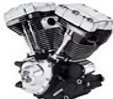
2012 Twin Cam 103 V-Twin 1,690 cc 83 hp