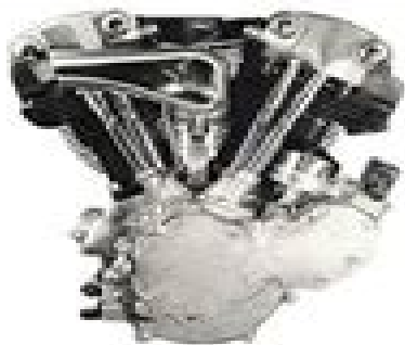
1936-1947 Knucklehead 990 cc & 1,200 cc 40 hp & 45 hp