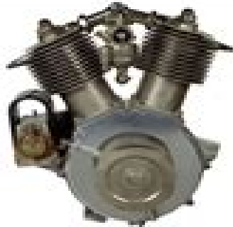
1909 First V-Twin 49 ci 6.5 hp