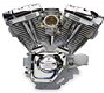
1999-2006 Twin Cam 88 1,450 cc 80 hp