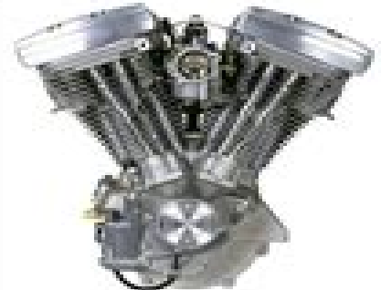
1984-1999 Evolution 1,340 cc 70 hp