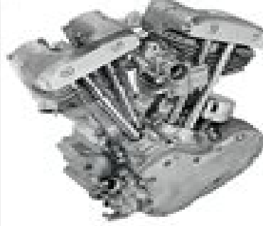
1966-1983 Shovelhead 1,208 cc 60 hp