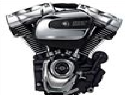
2017 Milwaukee-Eight 107 1,750 cc 92 hp