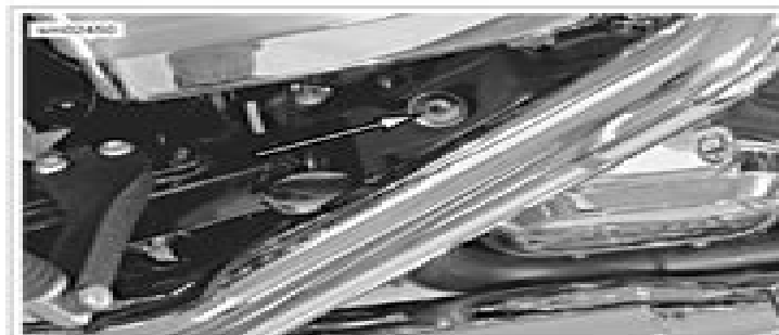
Figure 1-17. Transmission Filler Plug/Dipstick Location