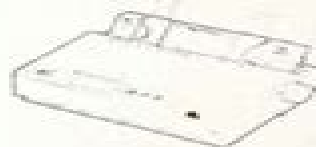
9-Pin Dot Matrix Printer