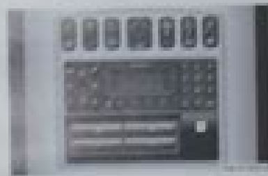
Top Shifter is the center console. Power Shifter is the top shifter when not