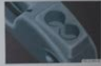
Top Shifter is the center console.

Always use proper technique for the vehicle's intended use. Always use proper technique for the vehicle's intended use. Always use proper technique for the vehicle's intended use.