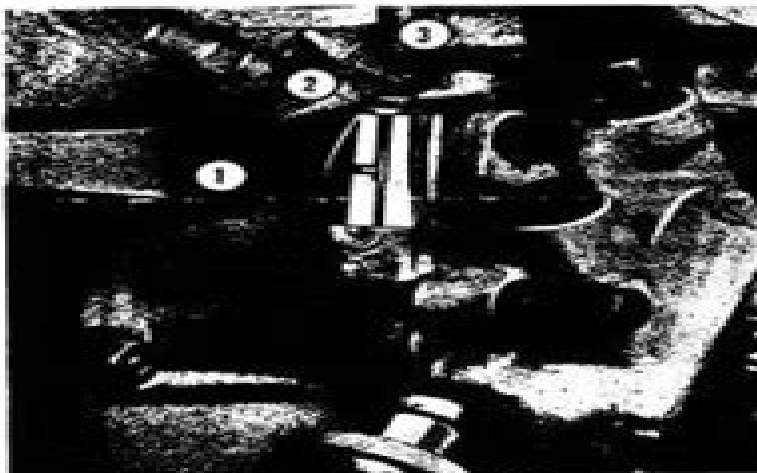
ILLUS. 3 CHAIN OILER ADJUSTING SCREW AND OIL PASSAGE (SIDE VALVE ENGINE)