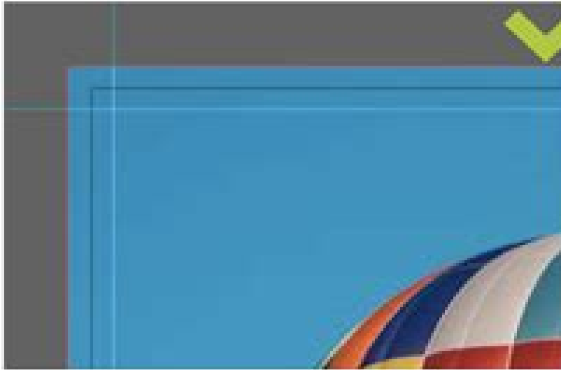
Printed Version with Correct Bleed