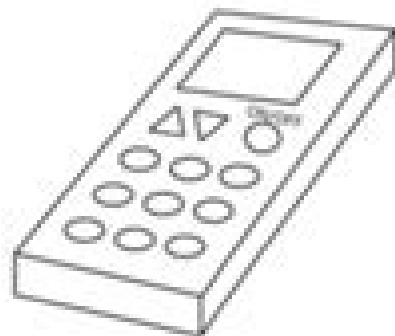
Indoor Air Handler