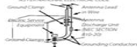
Power Service Grounding Electrode System (BNC AMP 250 (RMT) H)

EXAMPLE OF ANTENNA GROUNDING AS PER NATIONAL ELECTRICAL CODE