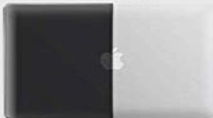
Apple logo OFF