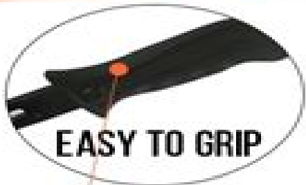
EASY TO GRIP