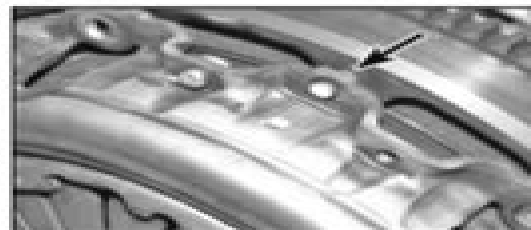
5.4 Locating dowel (arrowed) – marked for refitting

6 Check the friction disc facings for signs of wear, damage or oil contamination. If the friction material is cracked, burnt, scored or damaged, or if it is contaminated with oil or grease (shown by shiny black patches), the friction disc must be renewed.