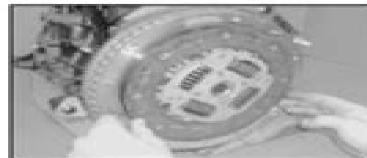
5.13 Fit the disc so the spring hub assembly faces away from the flywheel

14 Refit the pressure plate assembly, aligning the marks made on dismantling (if the original pressure plate is re-used), and locating the