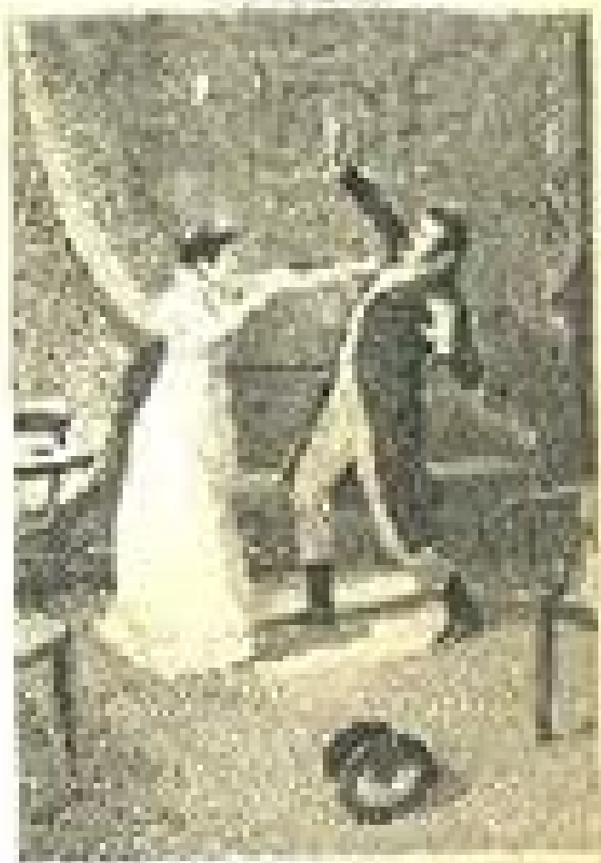
Portrait of a woman in a white dress by the artist's studio