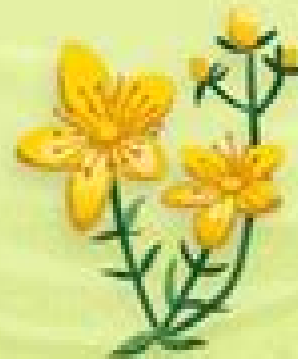
St. John's wort