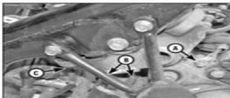
4.10a Engine earth lead bolt (A), coil primary connectors (B), oxygen sensor connector (C, hidden by engine hanger) – left-hand side of engine