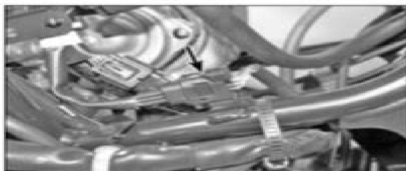
4.9c CKP sensor connector (arrowed)...