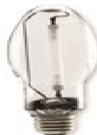
ED23.5 MOGUL BASE LU50/MOG LU100/MOG LU150/MOG