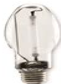
ED17 MEDIUM BASE LU150/MED