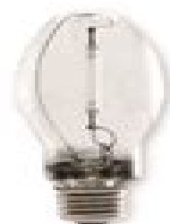
ED17 MEDIUM BASE LU50/MED LU70/MED LU100/MED