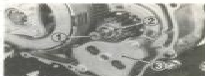
Fig. 14 (13) Oil through pipe (11) 1/4 inch lock nut (10) Oil pump