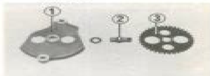
Fig. 15 (1) Oil pump-gear cover (2) Drive gear shaft (3) Drive gear