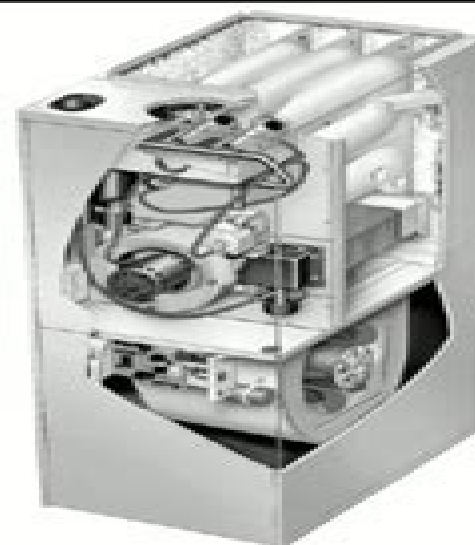
G26 FURNACE ▲ G26 HEAT EXCHANGE ASSEMBLY

Information contained in this manual is intended for use by qualified service technicians only. All specifications are subject to change. Procedures outlined in this manual are presented as a recommendation only and do not supersede or replace local or state codes. In the absence of local or state codes, the guidelines and procedures outlined in this manual (except where noted) are recommended only.