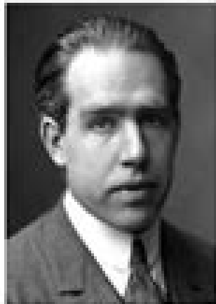
Niels Bohr (1885 – 1962)