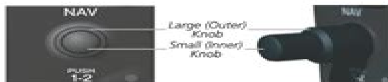
Figure 1-3 Dual Concentric Knob

The NAV , CRS/BARO , COM , FMS , and ALT Knobs are concentric dual knobs, each having small (inner) and large (outer) control portion. When a portion of the knob is not specified in the text, either may be used.