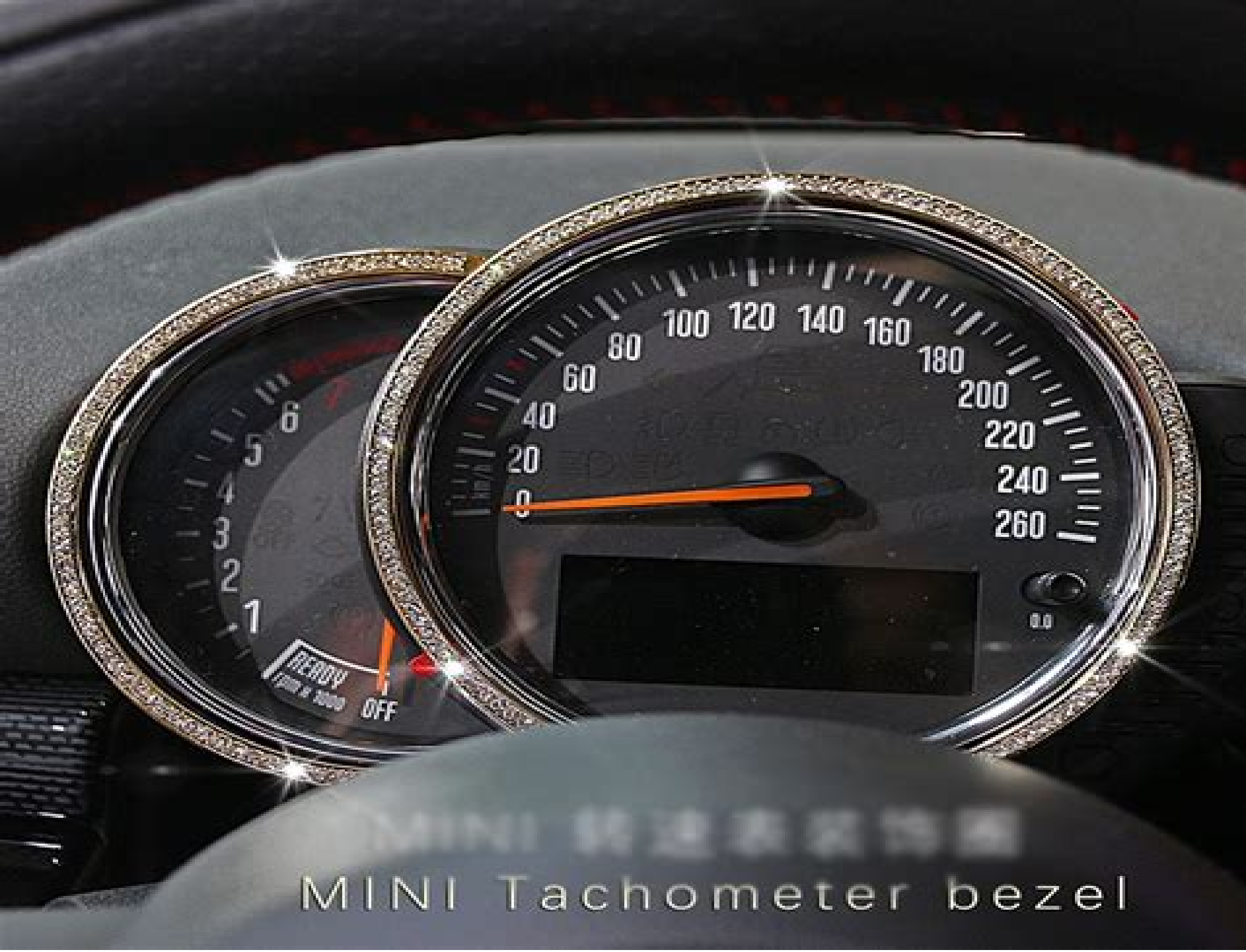
MINI 转速表装饰圈 MINI Tachometer bezel