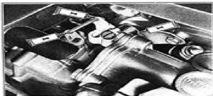
Figure 2-2. Throttle Cam and Carburetor Linkage Lubrication