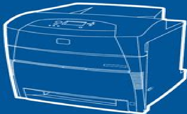
HP color LaserJet 5500/5550 Printers