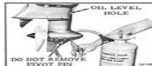
Figure 2-8. Gearcase