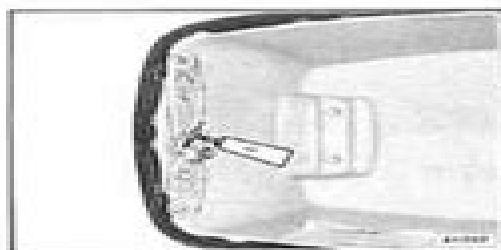
Figure 2-5. Motor Cover Latch Lever Shaft