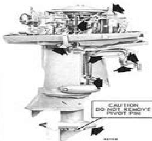
Figure 2-1. Starboard Side, 40 H.P. Electric