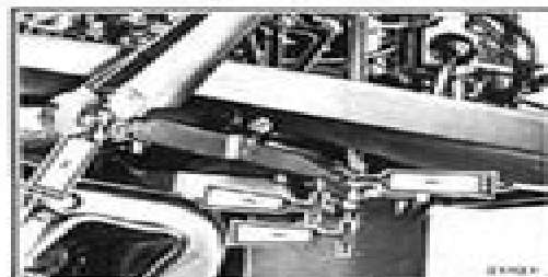
Figure 2-4. Throttle Shaft Bushings and Gears