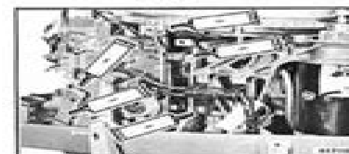
Figure 2-10. Gear Shift Lever Lockout, Safety Switch Cam and Neutral Start Lever and Cam