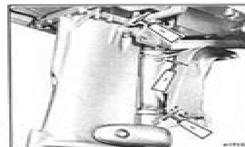
Figure 2-9. Swivel Bracket Fittings and Gearshift Lever Shaft