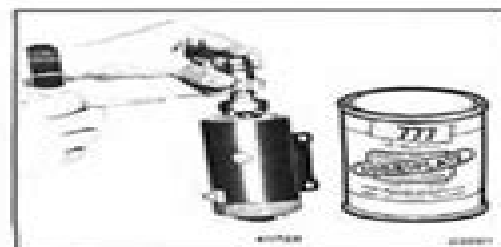
Figure 2-6. Starter Pinion Gear Shaft Helix