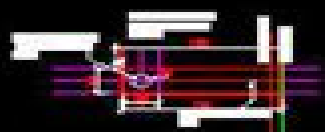
WALL BRACKET ELEVATION Scale 1:20