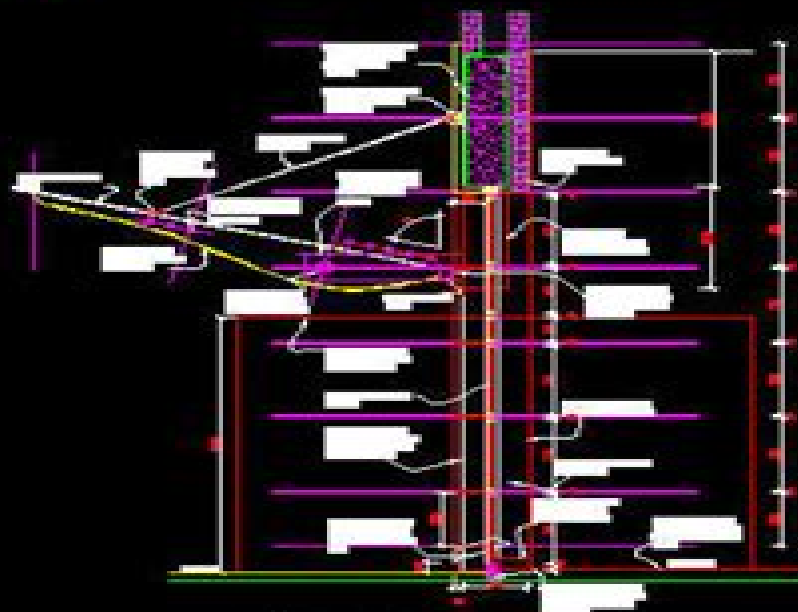
DETAIL SECTION Scale 1:20