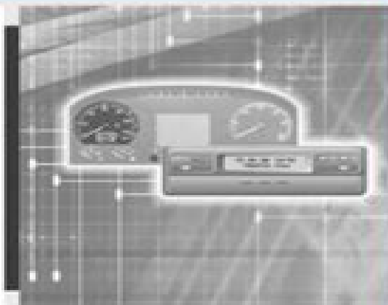
Tacógrafo Modular (1 día) MTCO 1390.1, 1390.3

Manual, Repuestos y Piezas originales VDO