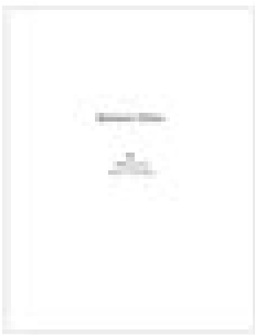
business-11.15 11/26/2018, 8:15 AM