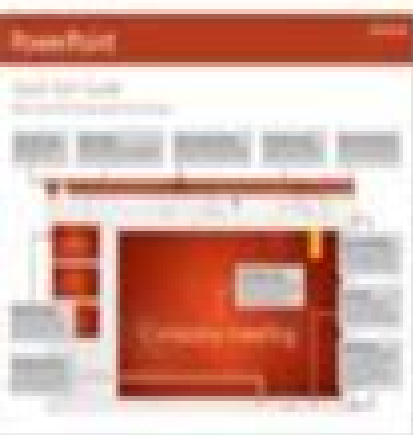
PowerPoint View PowerPoint PDF