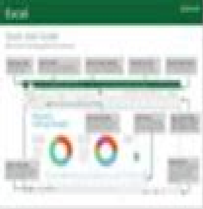
Excel View Excel PDF