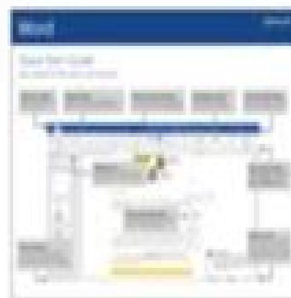
Word View Word PDF