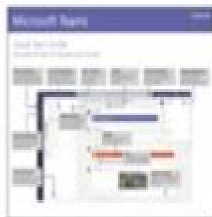
Teams View Teams PDF