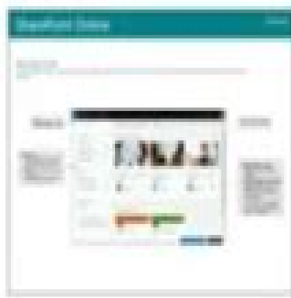
SharePoint Online View SharePoint Online PDF