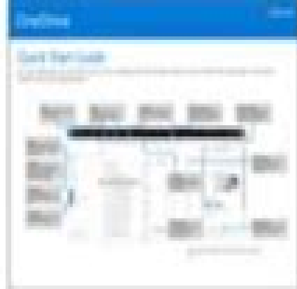
OneDrive View OneDrive PDF