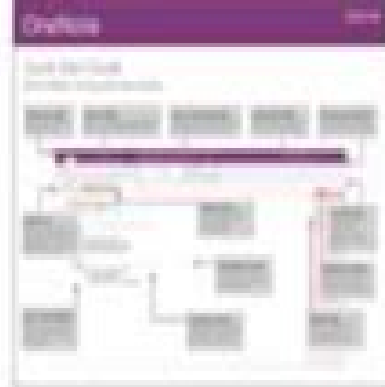
OneNote View OneNote PDF