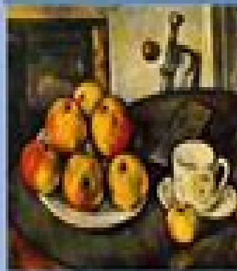
Paul Cézanne, Nature morte aux pommes et à la trompette.