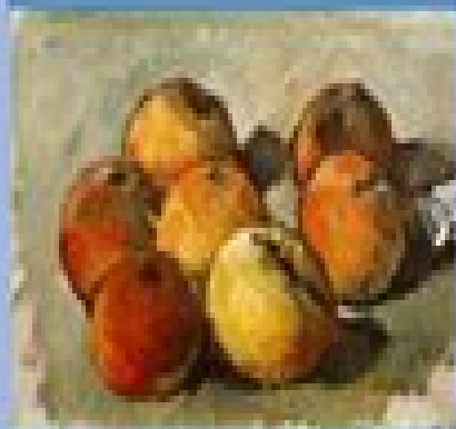
Paul Cézanne, Nature morte avec pommes et tube de peinture.