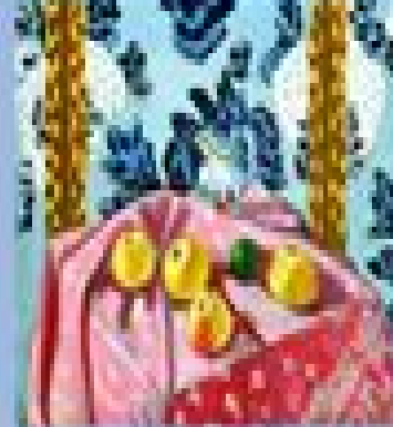
Henri Matisse, Nature morte avec des pommes sur une nappe rose.