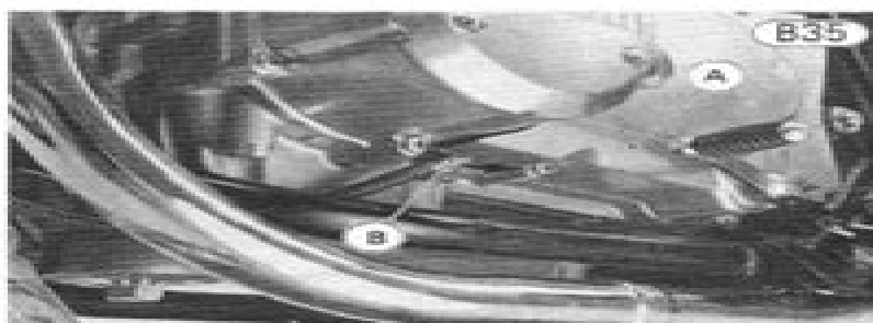
A. Engine Sprocket Cover B. Clutch Outer Cable

WARNING If the cable is not fully seated in the engine sprocket cover hole, it could slip into place later and the clutch would not disengage.