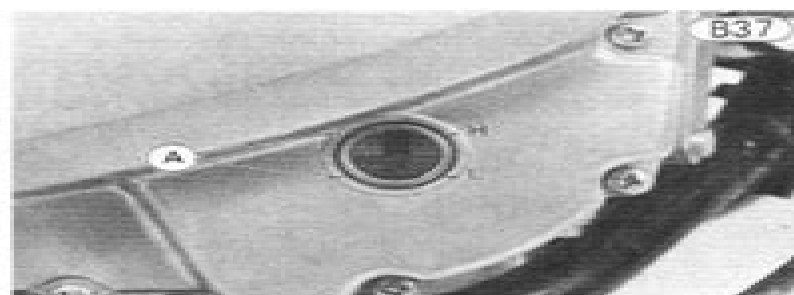
A. Level Lines