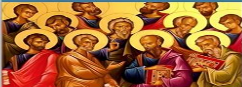
The Twelve Disciples

God dealing with the nation of Israel on the basis of His covenant.