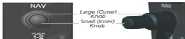
Figure 1-3 Dual Concentric Knob

The NAV , CRS/BAO , COM , FMS , and ALT Knobs are concentric dual knobs, each having small (inner) and large (outer) control portion. When a portion of the knob is not specified in the text, either may be used.