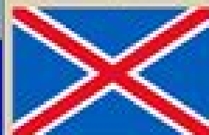
Autonomous Province of Beirndeighe