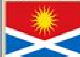
Dominion of Darien