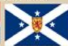
Nova Scotian Dominion