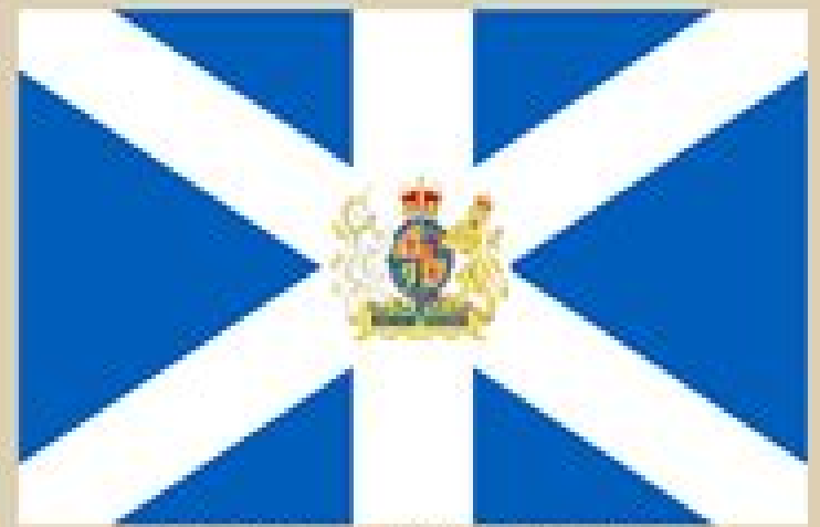
Kingdom of Scotland Rìoghachd na h-Alba Regnum Scotiae