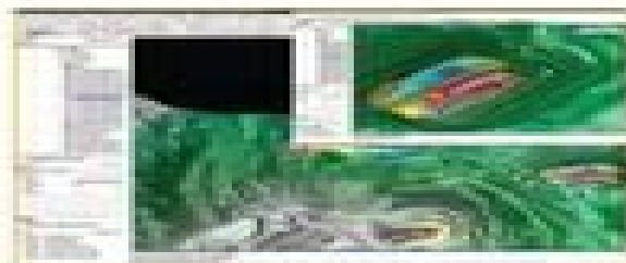
Может быть включено планирование создания очередности в любой форме производственной работы.