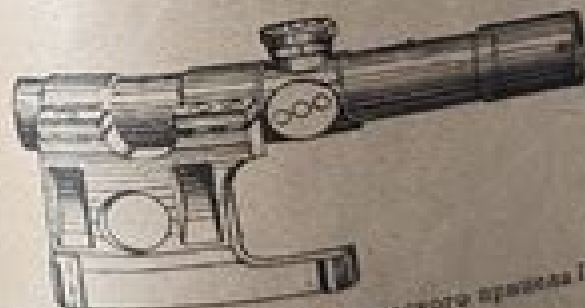
Рис. 90. Общий вид оптического прицела ПУ и хвостовейна